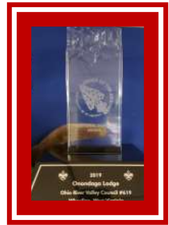
National Service Award

Develop leaders with the willingness, character, spirit and ability to advance the activities of their units, our Brotherhood, Scouting, and ultimately our nation.